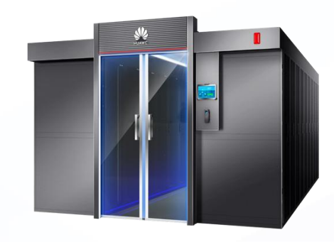
Standard Dual- row

Furthermore, the Huawei smart module uses the i<sup>3</sup> intelligent management to comprehensively improve the reliability and efficiency of power supply and cooling system. This significantly improves data center availability and O&M efficiency.