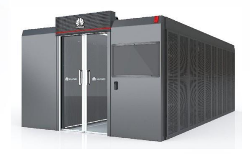
Standard Dual-row Smart Screen Version*